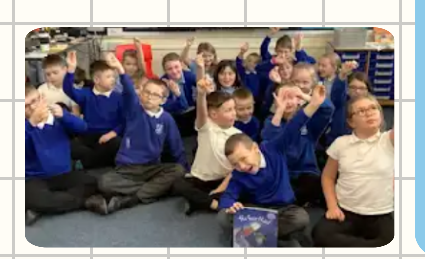
In Mastering Number, we have started "Going for Gold." We have had great fun each day practicing our times tables!