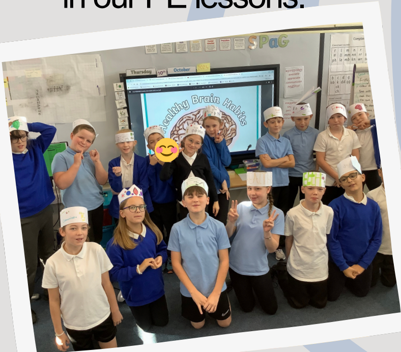
Thinking how we keep our brains healthy .